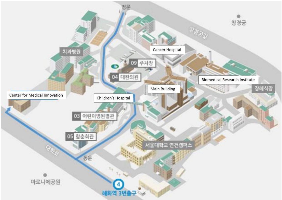
<Map of Seoul National University Hospital>